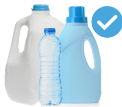
Plastic Bottles & Jugs